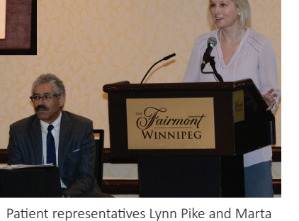
Kisiel reminded researchers to keep patient