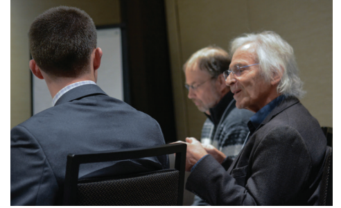
Small group breakout sessions.